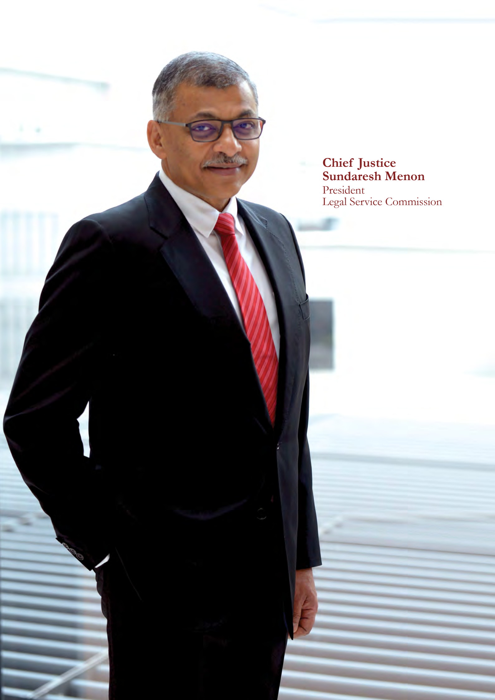
Chief Justice Sundaresh Menon President Legal Service Commission